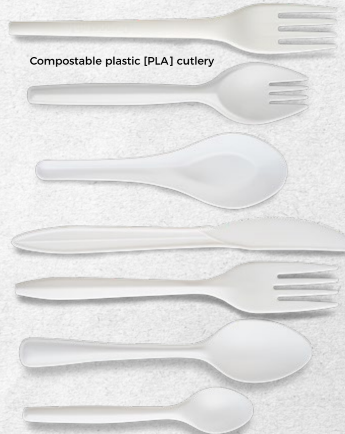
Compostable plastic [PLA] cutlery

Any utensil that can be used to eat food. This includes spoons, forks, knives, sporks, splayds and chopsticks which are designed to be used once, or a limited number of times, before being thrown away. Exemptions will also apply to cutlery that is attached as part of a pre-packaged product e.g. a plastic spoon attached to a yoghurt tub.